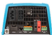
MultiPlus 500 / 800 / 1200 / 1600 VA