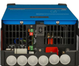
MultiPlus 2000 VA (bottom cover removed)